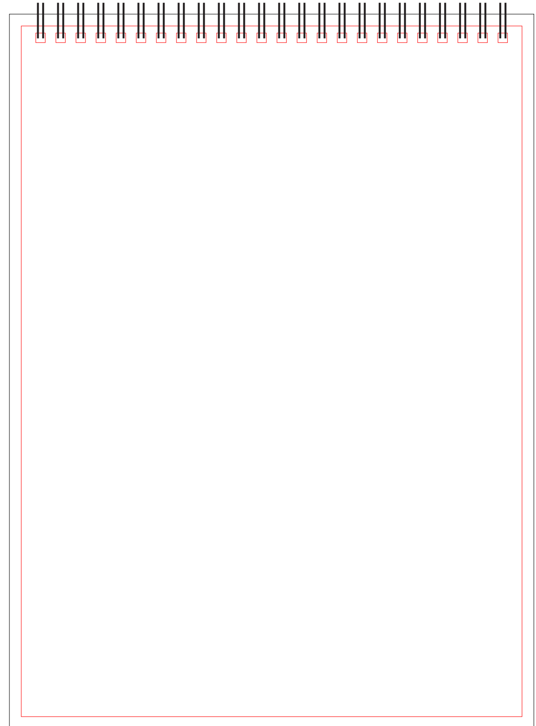
INNER BACK COVER