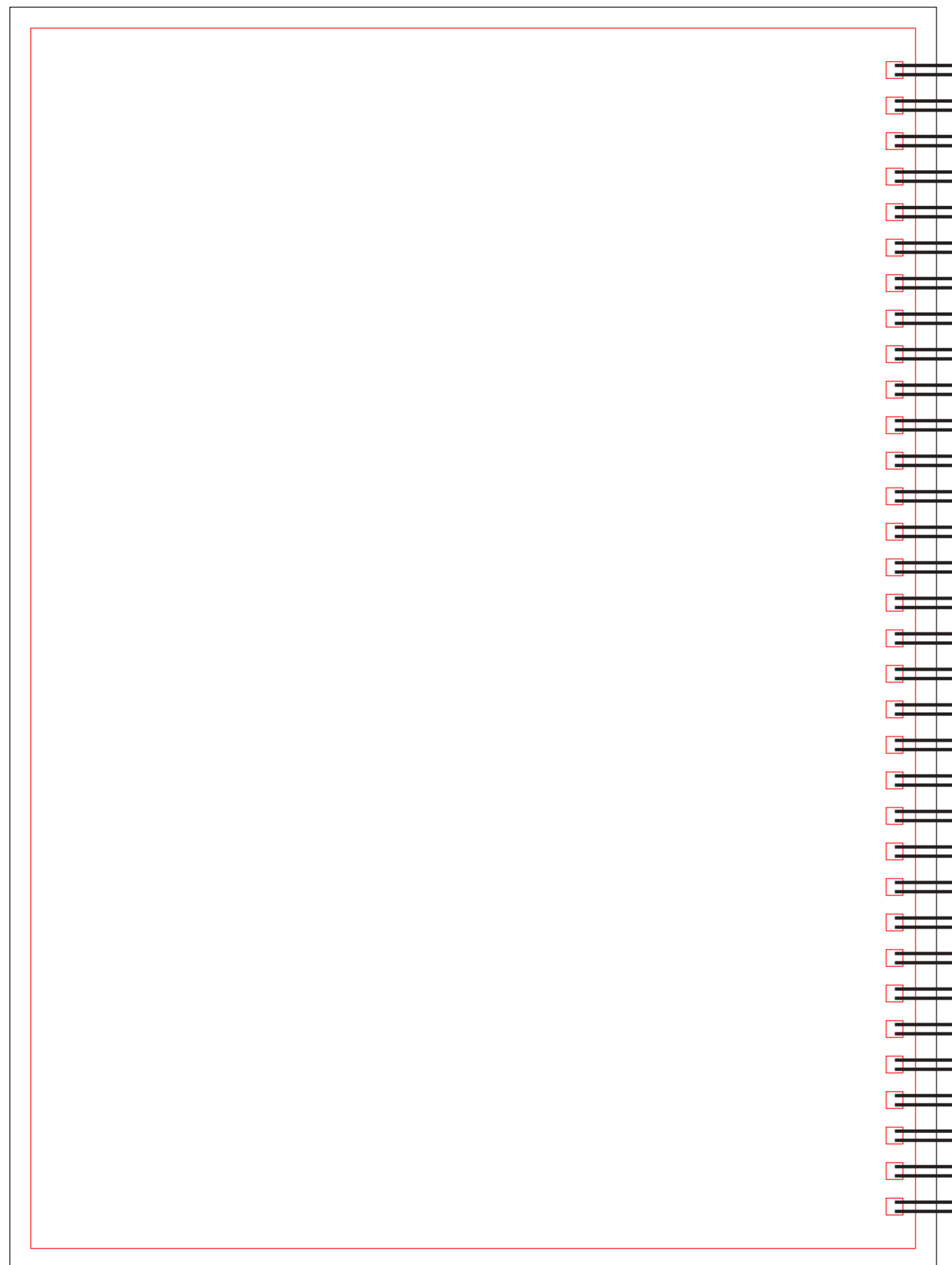
INNER FRONT COVER